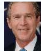
George W. Bush