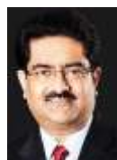
Kumar Mangalam Birla